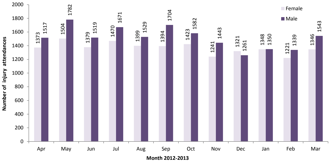
Table 1: Stepping Hill ED: Total injury attendances by injury group and month, April 2012 to March 2013